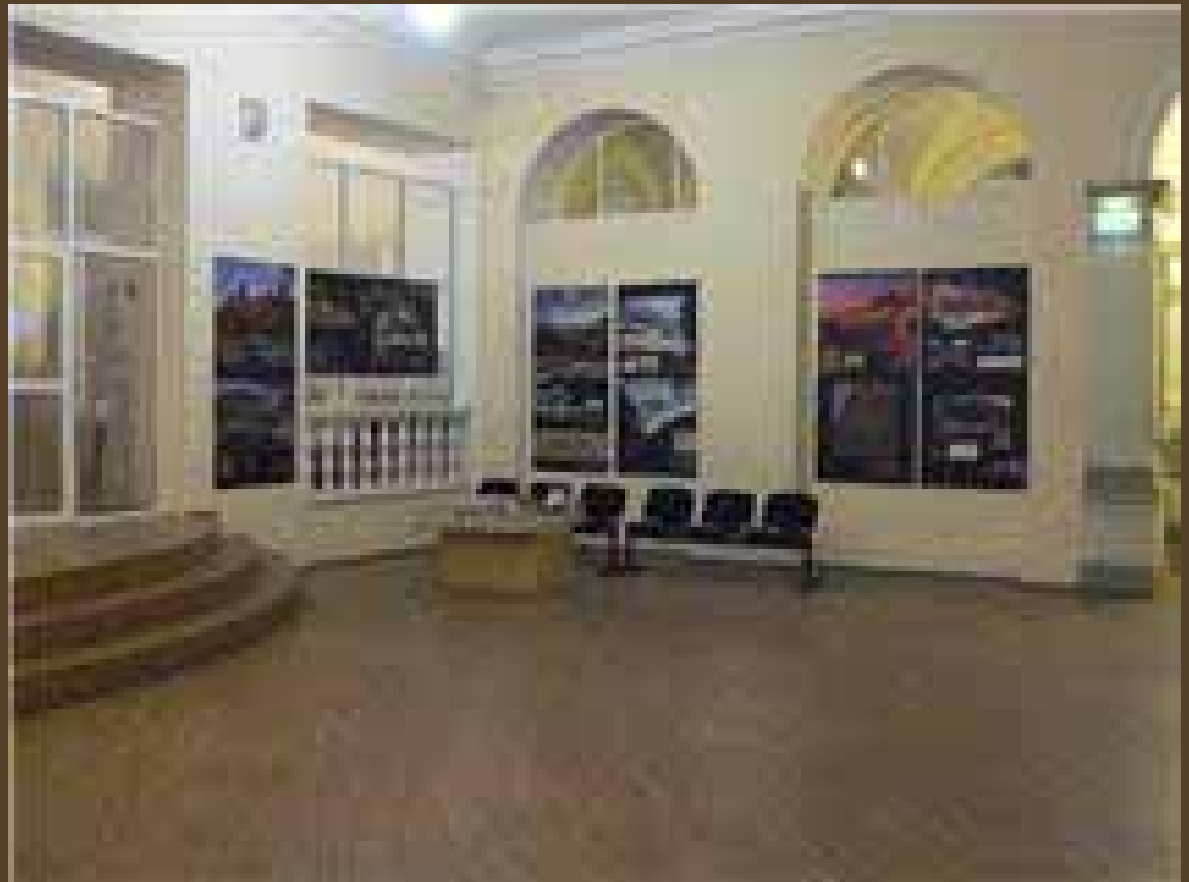
the exhibition opening