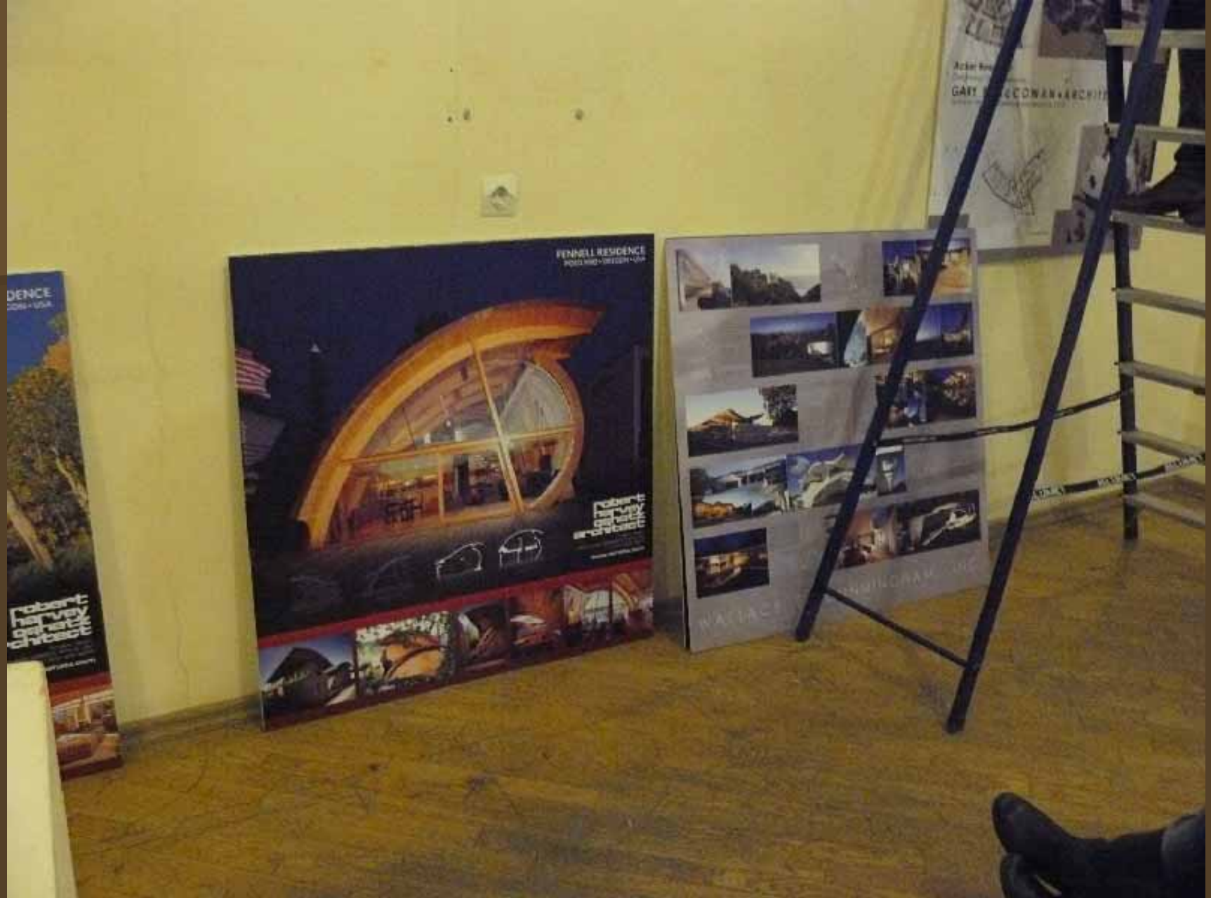
preparing the exhibition