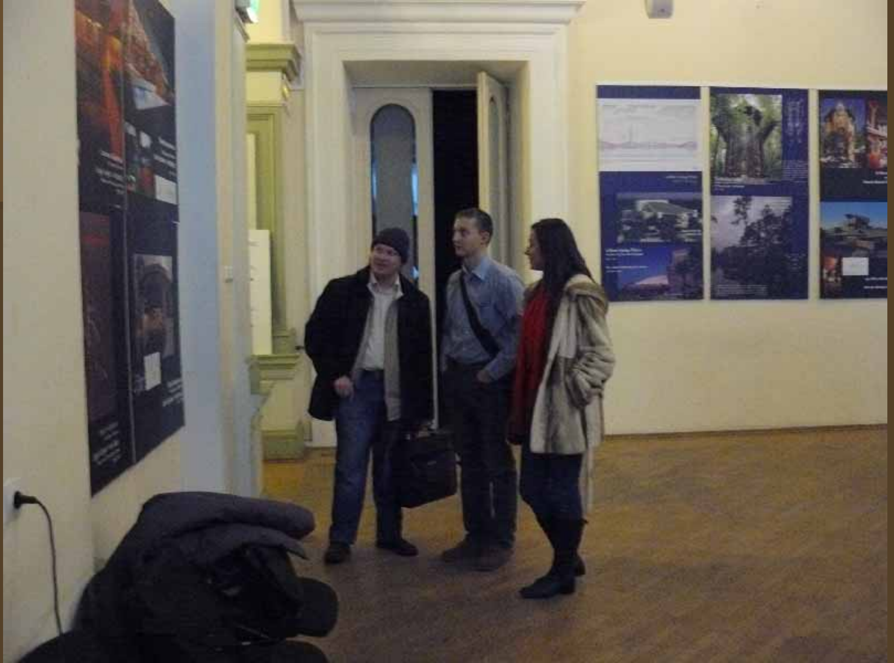
the exhibition opening