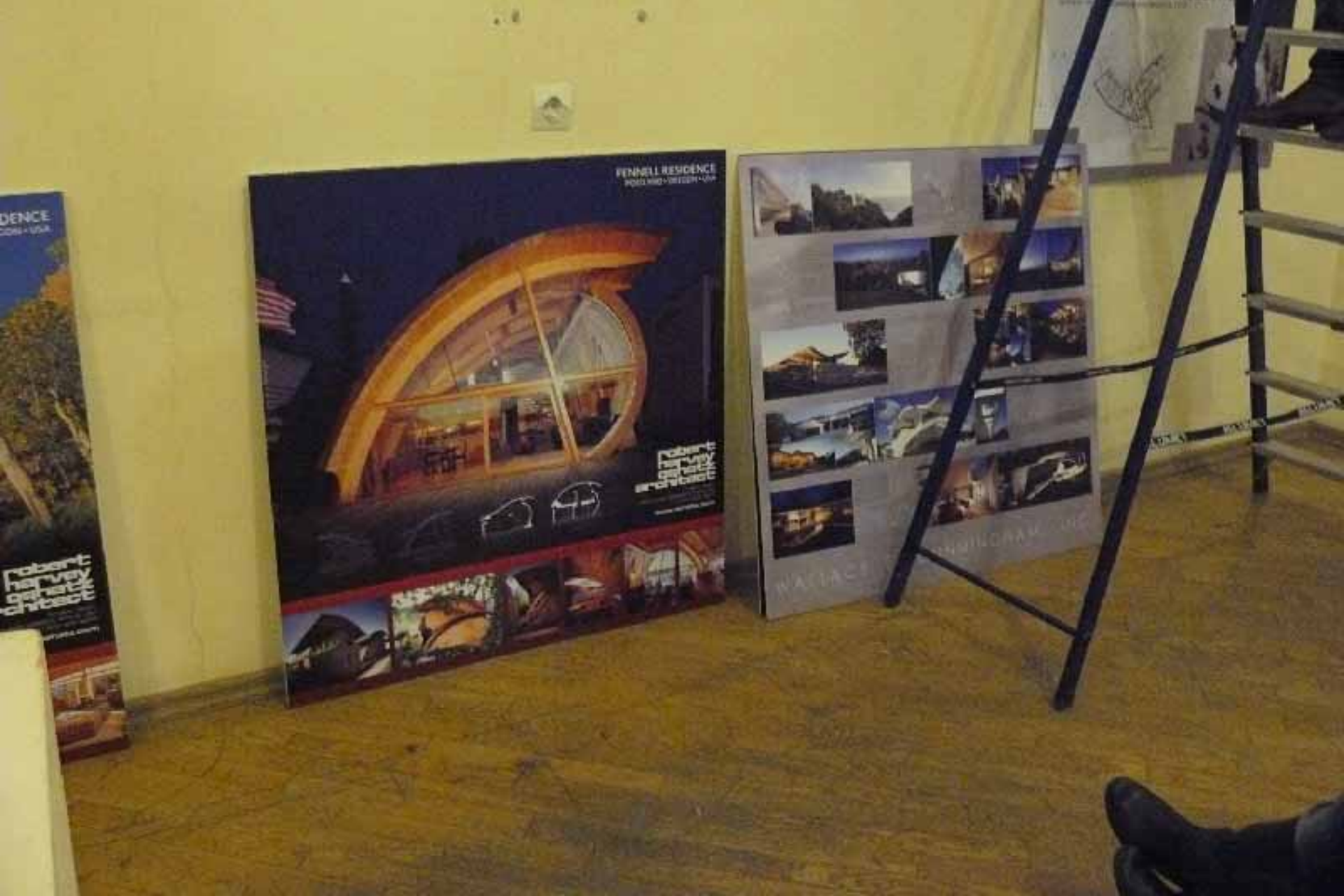
preparing the exhibition