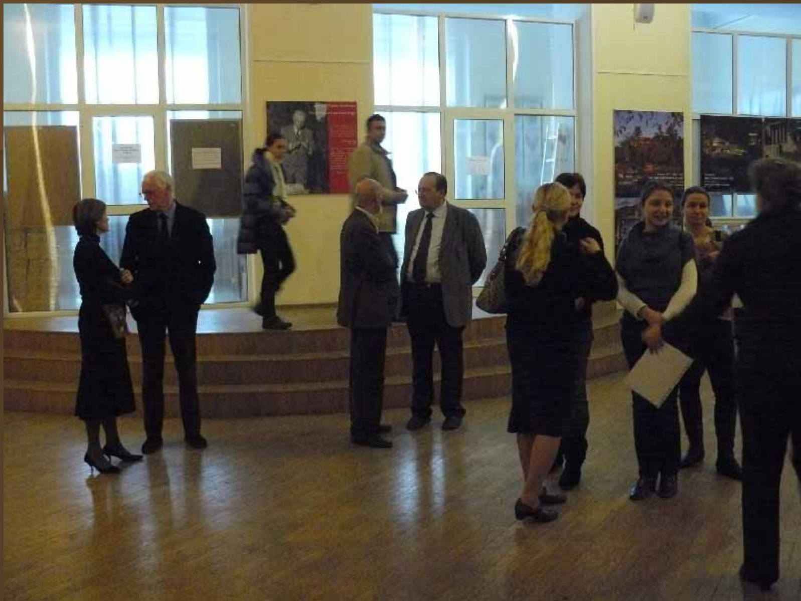
the exhibition opening