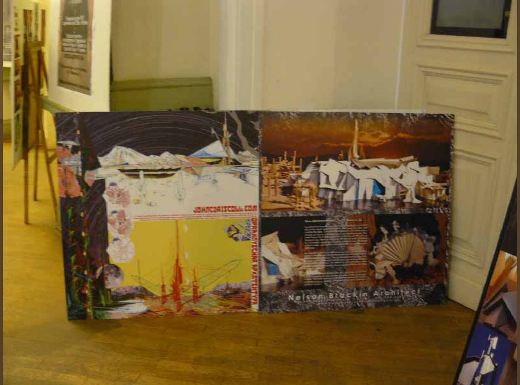
preparing the exhibition