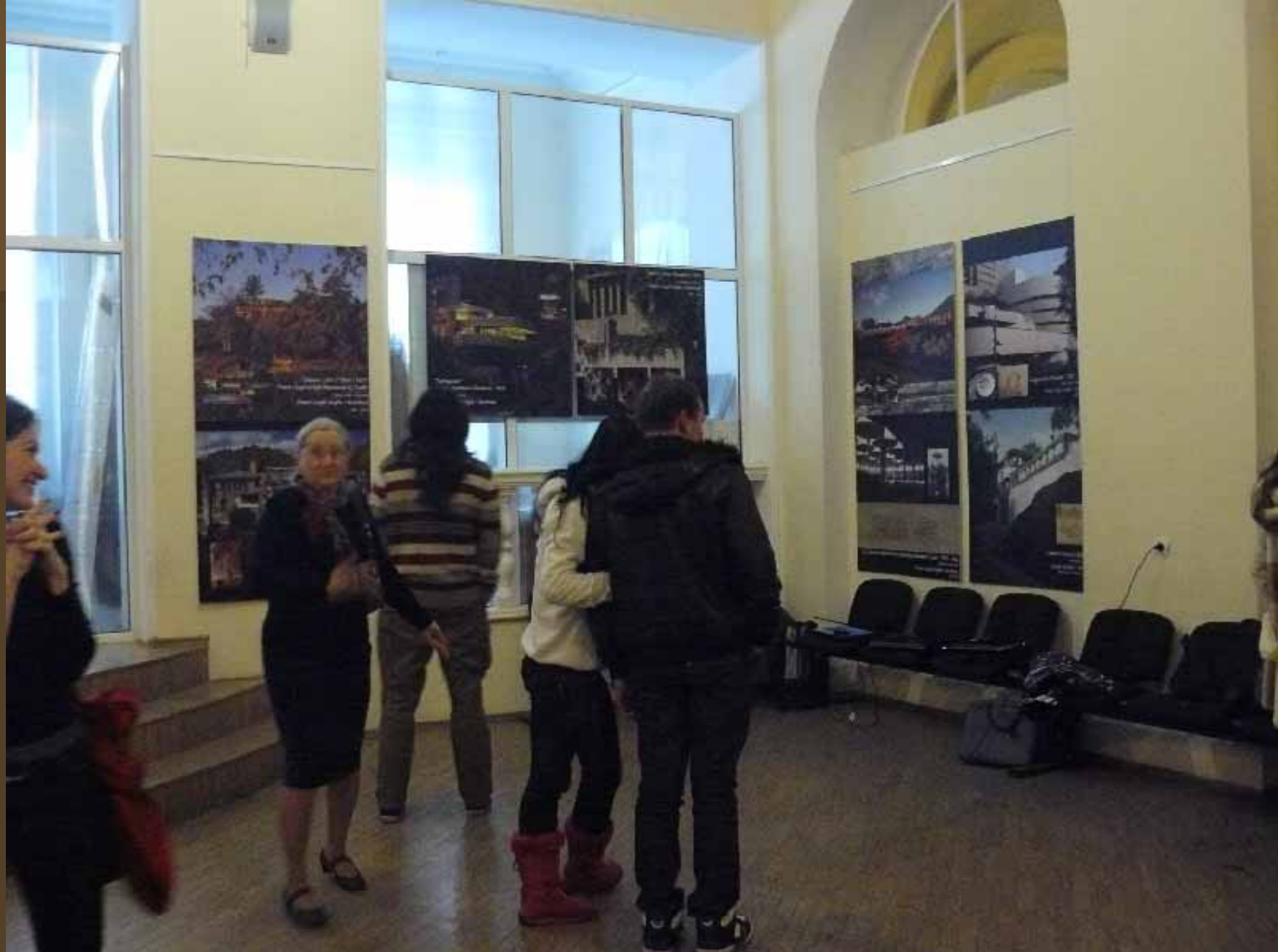
the exhibition opening