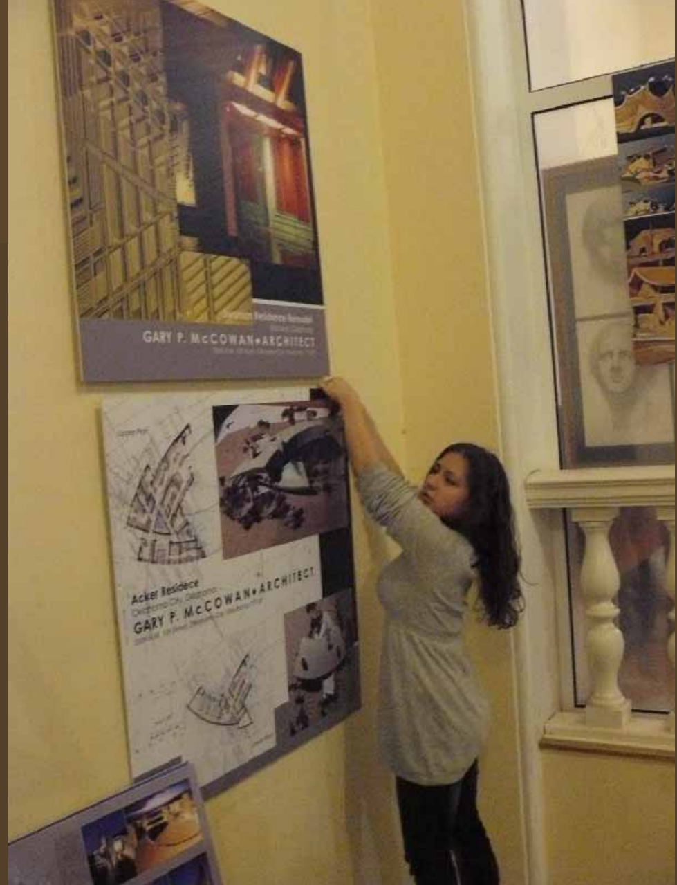
preparing the exhibition