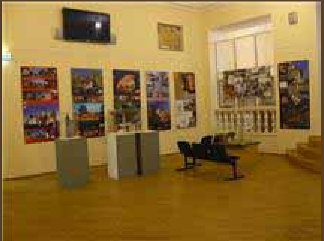
the exhibition opening