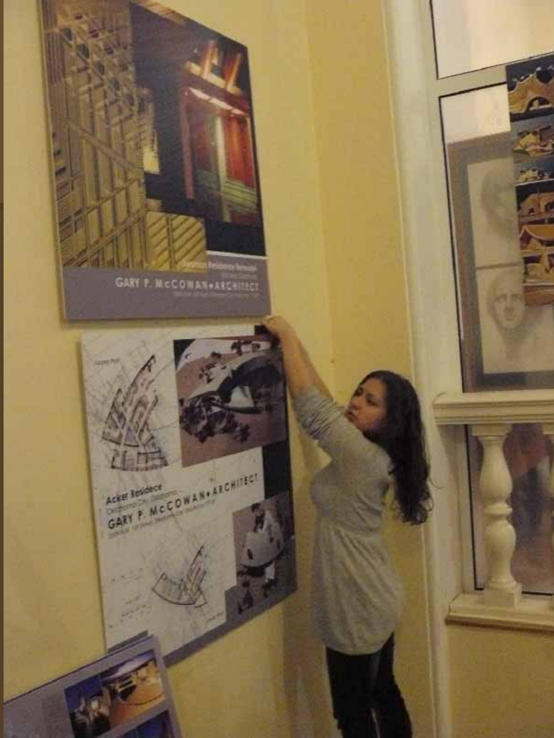
preparing the exhibition