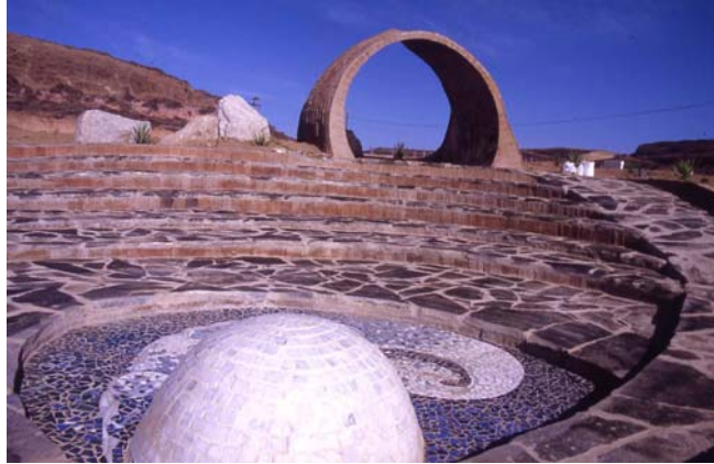
“Entre Corazon y Mar” Tijuana, Mexico 2004

available by Caminos y Puentes Federales. Other significant contributors to thank for a great deal of help were the Mission Valley, Tijuana and Rosarito Beach Rotary Clubs,